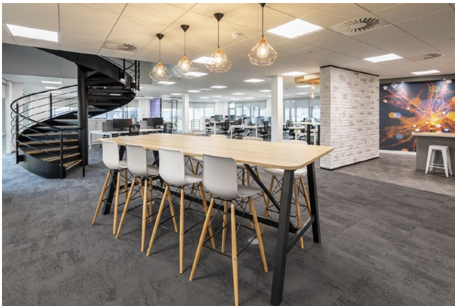
Range of collaboration spaces