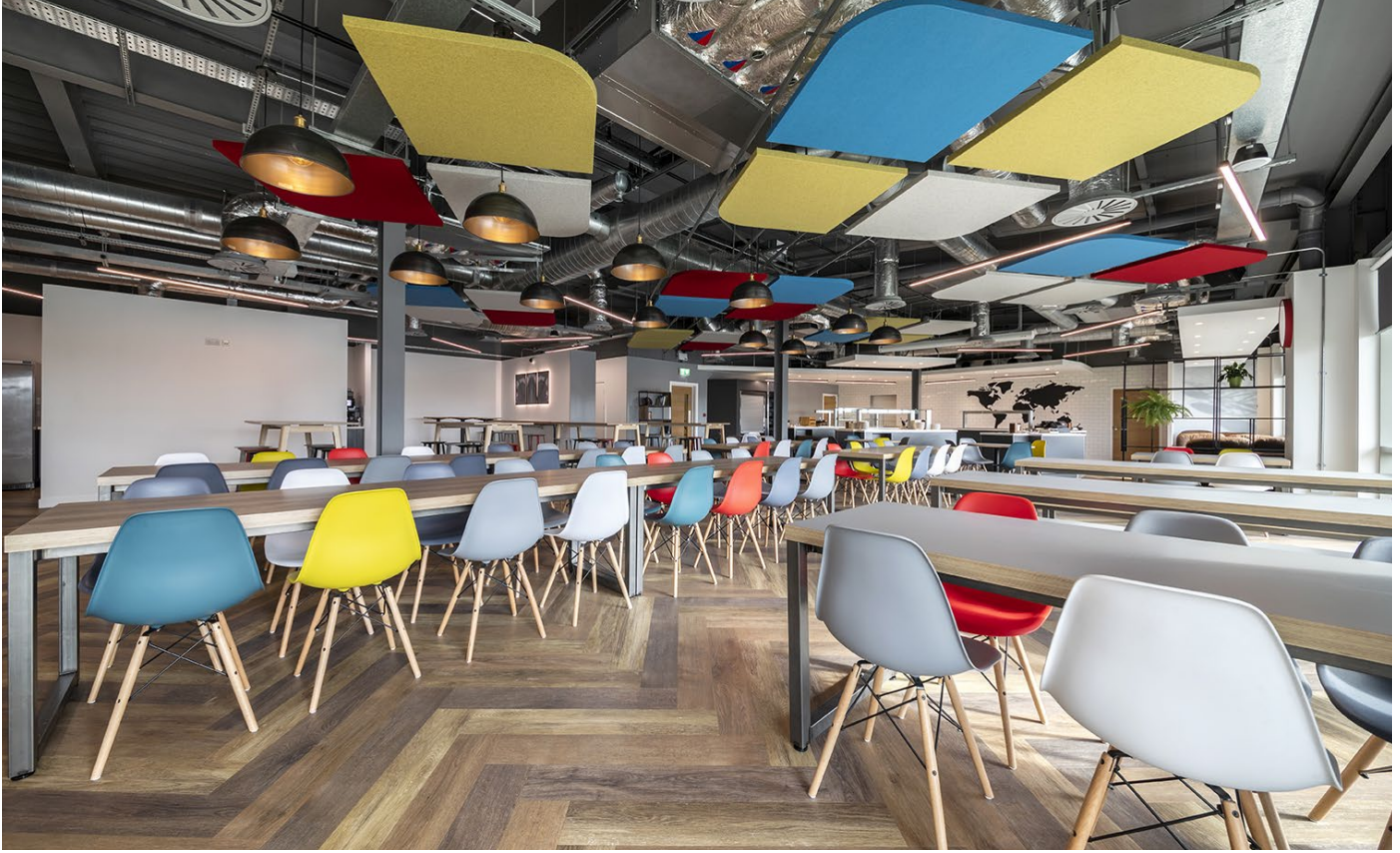
New eating and meeting space

Form identified two major staff concerns; the temperature in the offices, and an unloved canteen feel to the staff restaurant. The challenges for Form were to design and refurbish the restaurant to appeal to the office and factory-based staff – and then to carry out the office refurbishment around the workforce.