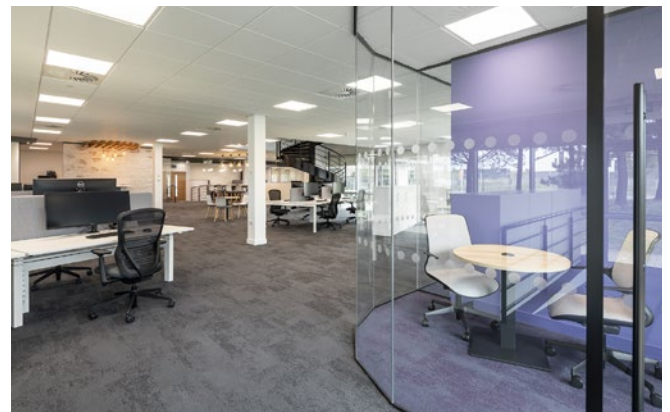
Agile working area, quiet room, collaborative spaces

Based on extensive client feedback, Form presented several design options, culminating in a solution that met all Bühler's criteria.