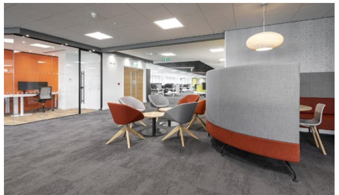
Focus room and informal meeting spaces